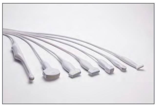
SONIMAGE® HS2 Compact Ultrasound System Transducers