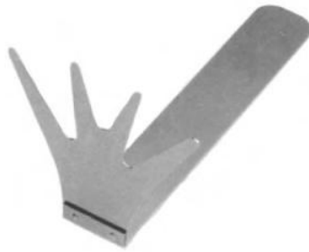
Derbyshire Tube Support #19-00416