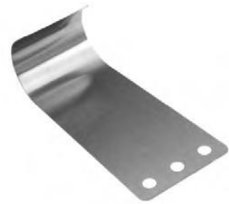
Wells Arm Protector (Adult Stainless Steel) #19-00417

The NEW GIOFLEX Flexible Support System for Anesthesia Tubing! An adaptable and reliable device that allows secure flexible positioning of variously sized anesthesia tubing between equipment and the patient. Improves the safety of all types of general anesthesia delivery. Particularly beneficial during ENT and Neuro cases where access to the patient's head and ET tube is limited. Clamps to the OR table rail with unlimited positions. #19-00-392