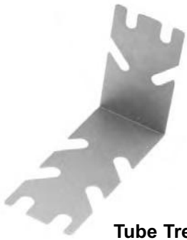
Tube Tree Aluminum #10-81401