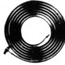
Oxygen Pressure Hose male/female threaded connector (9/16"-18)