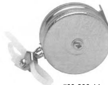
#69-206-14 Hose Retractor 18" Length