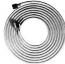
Nitrous Oxide/Medical air Pressure Hose female/female threaded connector (3/4"-16)