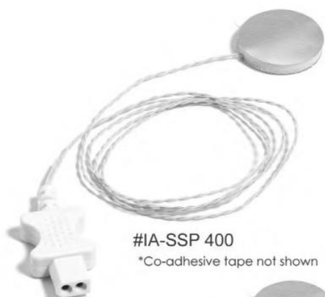
#IA-SSP 400 *Co-adhesive tape not shown