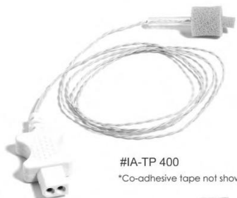
#IA-TP 400 *Co-adhesive tape not shown