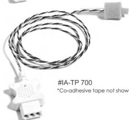
#IA-TP 700 *Co-adhesive tape not shown