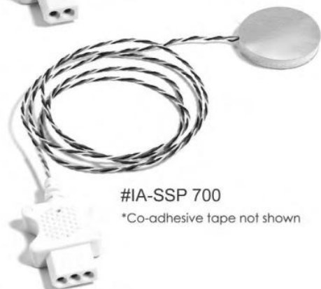
#IA-SSP 700 *Co-adhesive tape not shown